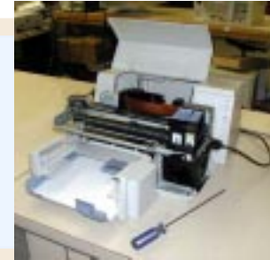
Older equipment is repaired and sold with a 30 day warranty

LANtek is a value-added reseller of computer products, located in Kutztown, PA. Our Asset Recovery division is focused on the internal redeployment, remarketing, retirement, and the charitable donation (on behalf of your company) of PCs and microcomputer equipment and associated peripherals. LANtek's Asset Recovery and Disposal programs are designed to address your security needs while protecting your company from the potential legal issues involved with disposal of hazardous wastes.