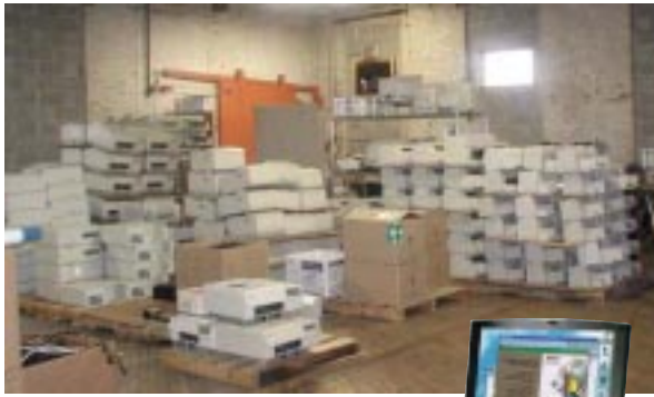
LANtek's 30,000 square foot facility has space for storage