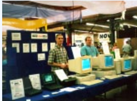
Sales booth at recent Market Pro Show

As your company upgrades its PCs, LANtek's Asset Investment Recovery Plan allows you to recoup some of the costs of phasing out older equipment, while addressing the safety issues involved in the disposal of obsolete equipment. Contact us at 610-683-6883 to discuss how our service can benefit your company.