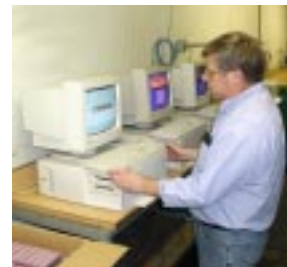
Hard drives are wiped, OS reinstalled before sale.

While more and more companies are taking steps to protect confidential information through the use of firewalls, document shredders, passwords and anti-virus software, few worry about the computers and hard drives where this sensitive information is stored. Many believe that change to the F disk or reformatting the hard drive will completely remove sensitive data. It does not. LANtek uses a special software program to protect your corporate data and insure HIPPA compliance. Our service includes wiping all information and software resident on the hard drive, thereby shielding your corporation from confidential data loss and software piracy issues.